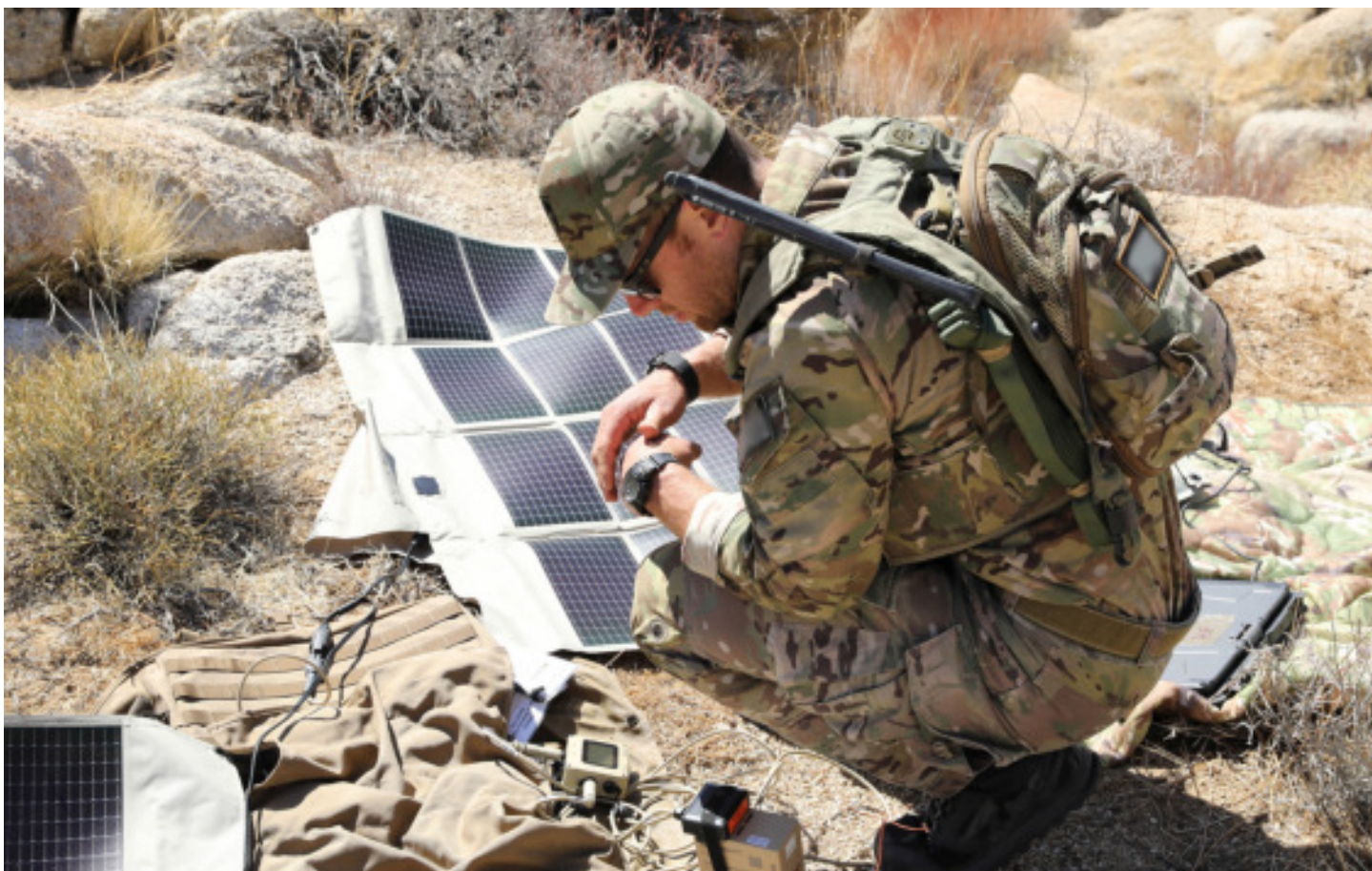
A U.S. Army Green Beret with 1st Special Forces Group (Airborne) sets up solar panels for operational communications at the National Training Center, Fort Irwin, California. The solar panels enable special operations forces to operate their equipment in the most remote locations and continue training forward of conventional forces while moving as a team through rough desert terrain, simulated ambushes, and limited communications.