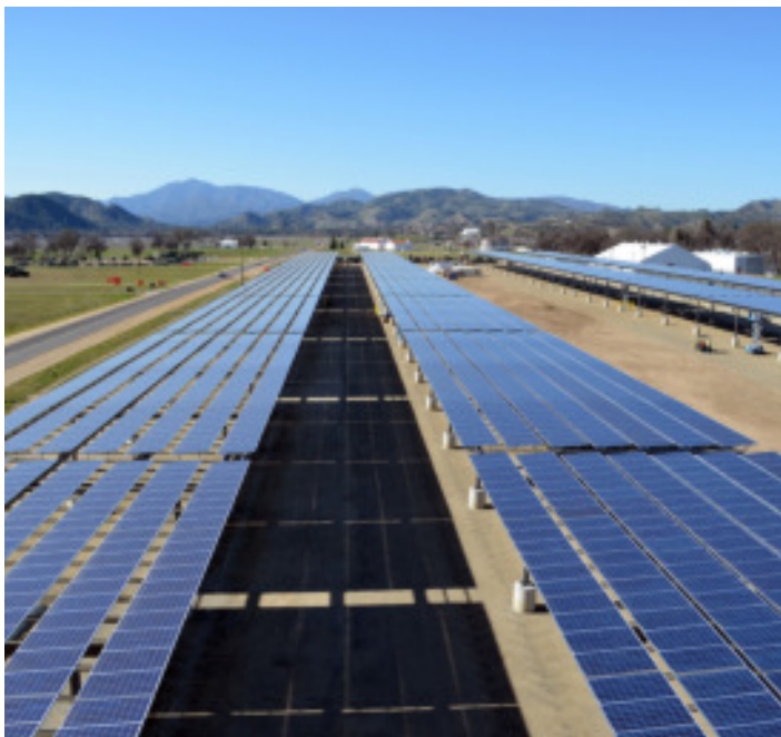
Solar panel arrays form a canopy at a construction site in Fort Hunter Liggett, California. The construction site is for phase one and two of a solar microgrid project at the installation, managed by the U.S. Army Corps of Engineers Sacramento District. Along with energy production, the panel arrays provide shade for the majority of the post's vehicles. Fort Hunter Liggett is one of six pilot installations selected by the U.S. Army to be net zero energy, meaning the installation will create as much energy as it uses.

alone, the Army enhanced installation-wide resilience by bringing systems online such as Fort Irwin's water treatment plant upgrade, Fort Knox's 2.1-megawatt solar field, and Fort Carson's 8.5-megawatt-hour lithium battery. There are 950 renewable energy projects supplying 480 megawatts of power to the Army today and 25 microgrid projects scoped and planned through 2024. The Army will continue these and other efforts under the Army Installation Energy and Water Strategic Plan to maximize resilience, efficiency, and affordability on every installation. In collaboration with adjacent communities and stakeholders, the Army and its partners will invest across all its installations in onsite, backup renewable generation; large-scale battery storage; microgrids; and utility systems updated to current industry standards. 5 The Army will install a microgrid on every installation by 2035. The Army will also pursue enough renewable energy generation and battery storage capacity to self-sustain its critical missions on all its installations by 2040. Because of their role in critical defense missions and preparing and deploying forces, Mission Assurance Installations, Mobilization Force Generation Installations, and Power Projection Platforms will have priority for energy and water resilience projects.