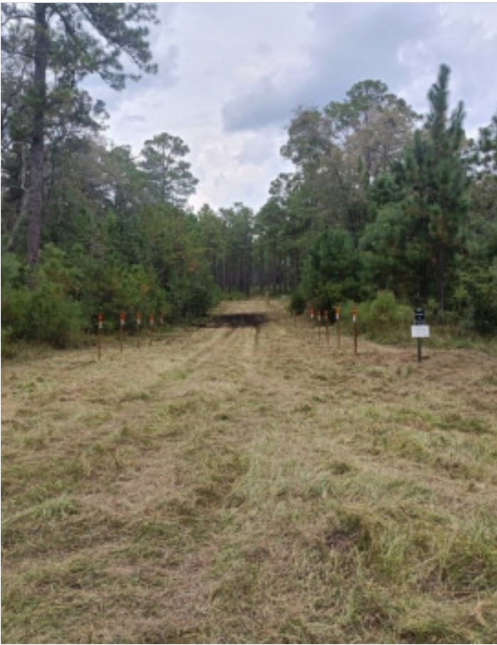
Integrated Training Area Management-constructed low water crossings are sustainable structures which facilitate maneuver through wetlands without precipitating erosion or obstructing the natural course of water. Fort Stewart, Georgia.

and maintain sustainable maneuver training areas. As a result, ITAM supports resilient bases, while ensuring spaces remain accessible to support Soldier training and mission requirements. Using ACUB, ITAM, and similar programs, land managers assist Senior Commanders in carrying out their responsibilities by managing soil, species, vegetation, coastlines, forests, wildland fire, waterways, wetlands, and watersheds using tools and techniques that account for climate change threat mitigation alongside Army and community needs.