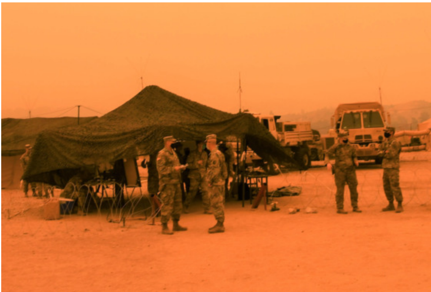
Nearby wildfires cause a heat wave and heavy smoke that blocks out the sun at Fort Hunter Liggett, California, while Soldiers from the California Army National Guard's 79th Infantry Brigade Combat Team conduct a Warfighter exercise at the fort.

into existing instruction and associated educational exercises. Overall, program of instruction (POI) updates will balance existing critical learning requirements and available time with the urgency of climate change. No matter how a particular course changes, revised training will always incorporate the latest climate science into training modules. To do so, the Army will publish climate change lessons learned and best practices every two years starting in 2024. The Army will fully implement climate-informed POIs no later than 2028, ensuring all Army people—and especially those on track for strategic leadership—are well educated in these critical issues.