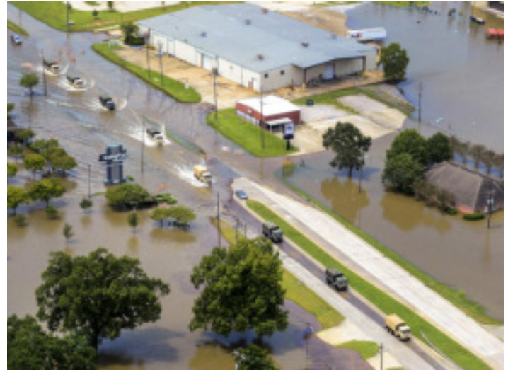
Army tactical vehicles transport flood relief supplies along a highway in Denham Springs, Louisiana after more than 30 inches of rainfall caused severe flooding in southeast portions of the state. The Soldiers and vehicles are assigned to the Louisiana Army National Guard, which mobilized more than 1,000 personnel to respond to the flooding.

The world is already experiencing the compounding effects of climate change. Immediate hazards associated with climate change include higher temperatures;